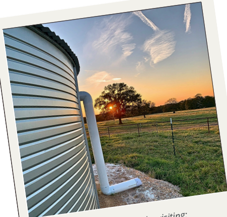
Find out more by visiting: www.posgcd.org/rainwater