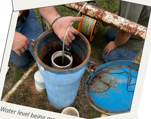
Water level being measured.