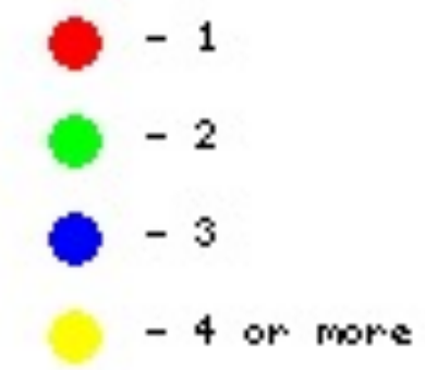
ALL 4-H WATER AMBASSADORS