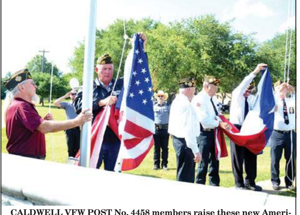
CALDWELL VFW POST No. 4458 members raise these new American and Texas flags at the Burleson County Sheriff's Office on Wednesday, June 17.

The Community Development Block Grant See SNOOK, page 14