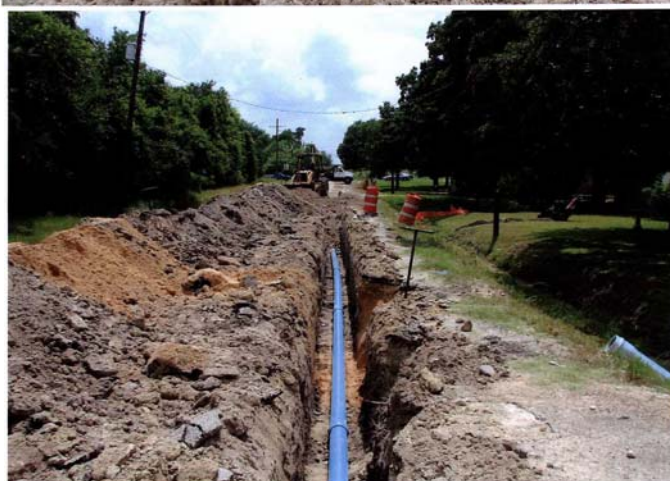
Above are pictures of recent repair and replacement of obsolete water lines from the project in Somerville made possible by the District's Conservation Grant Program.