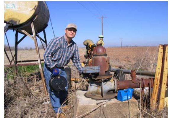
POSGCD staff uses an E-line to measure the water level in this irrigation well in the Brazos River bottom.