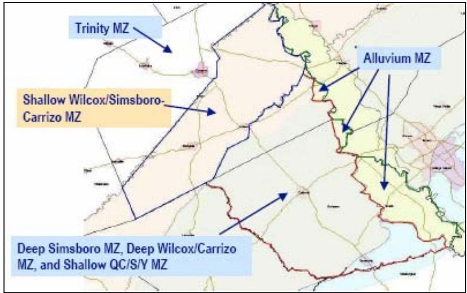
Figure 1. Map of Groundwater Management Zones